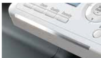
LED Status Display