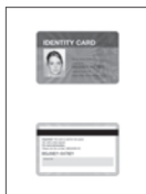
ID Copy Function

The bizhub 185en/165en is a full-featured 3-in-1 MFP designed to meet printing, copying and scanning needs, yet be simple and intuitive to use. The operation panel features a Shortcut key, which can be freely assigned to one of four commonly used copy functions (Combine Original 2-in-1, Sort, Erase, and Book Separation), as well as an ID Copy key for copying both sides of small-sized documents to one page, function keys for instant access to print settings, numeric keys and a reset key. A unique LED Status Display and clear Error Status Indicator offer at-a-glance visual feedback even from a distance, while LED-backlighting ensures a bright, readable display. Routine maintenance tasks and paper replenishment have also been simplified to minimise downtime and maximise productivity.